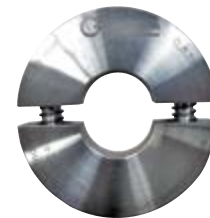
Stainless steel clamping shells