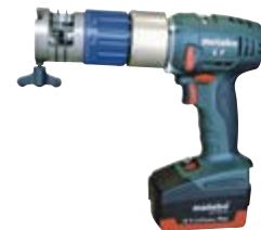
RPG ONE Cordless