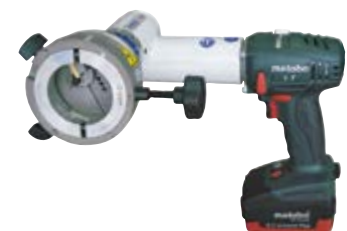
RPG 2.5 Cordless