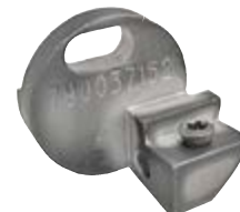
Tool holder WH