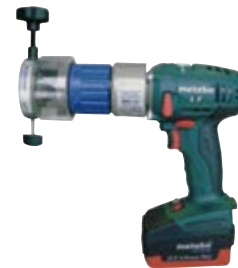
RPG 1.5 Cordless