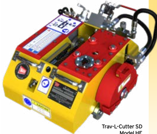
Trav-L-Cutter SD Model HE (Hydraulic)

On the spindle cutting side, a totally redesigned spindle gearbox offers far greater oil and cooling capacity. It uses cast in cooling fins with enlarged oil expansion chambers, finished in a heat dissipating coating. These new components, coupled with newly specified synthetic oils, greatly extend the machines duty cycle, particularly in extreme, high heat operating environments such as the desert.