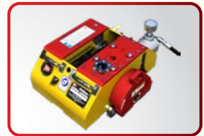
Trav-L-Cutter SD Model E (Pneumatic)