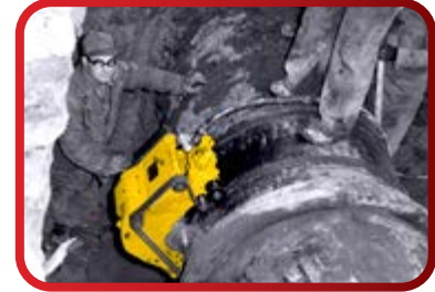
First introduced in 1949, Trav-L-Cutters are highly durable and in use all over the world

◀ Wheel sets can be repositioned to accommodate any size workpiece diameter