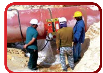
Trav-L-Cutter SD can operate on varying pipe diameters by adding additional chain sections