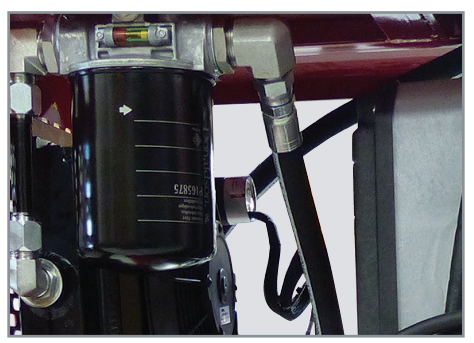
Spin on full flow hydraulic oil filter helps extend oil and pump life.