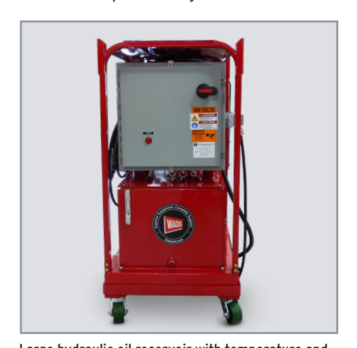
Large hydraulic oil reservoir with temperature and level gauge plus warning light.