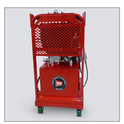
Innovative design submerges pump in oil reservoir for cooler, quieter operation.

The HPU-20's vertical design allows for a more compact footprint, making it easier to transport, store and operate in tight quarters. All the electronics are located above the oil reservoir for space savings, and away from any potential contamination. Placing the pump assembly inside the oil reservoir contributes to its compact design.