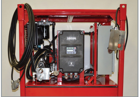
HPU-20GY model with water based glycol in place of hydraulic oil is also available.

DRIVE MOTOR TORQUE COMPARISON ELECTRIC, PNEUMATIC & HYDRAULIC DRIVE