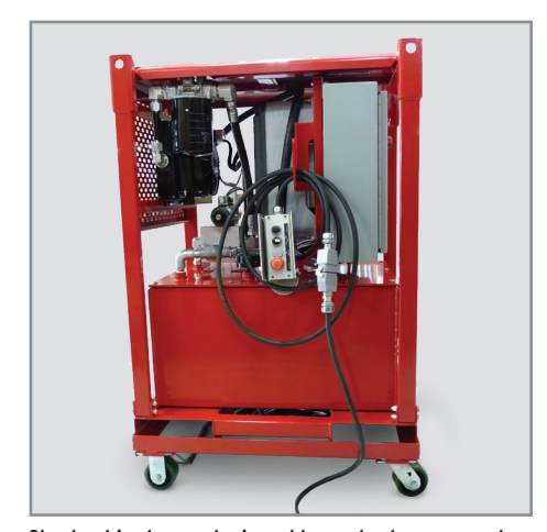
Steel cabinets are designed to protect power and control circuitry from damage.