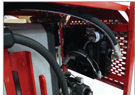
Heavy duty cooling and hydraulic manifold help keep fluid temperatures down.