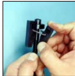
3. Slide the clamp leg set onto the draw bar and slip leg set over draw bar head slots.