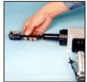
4. Reinstall draw bar and retainer.