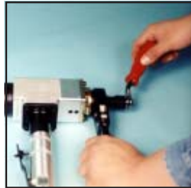
2. Remove draw bar using the clamp ratchet.