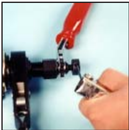
1. Remove draw bar retainer.

NOTE: To determine which leg set is required, measure the work piece pipe I.D. Refer to the Leg Chart. Each leg set is stamped with a reference number which corresponds to the pipe I.D. range, which the leg set will accommodate. (see clamp leg chart)