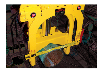
Quickly cuts through pipe with an orbital cutting motion that extends blade life