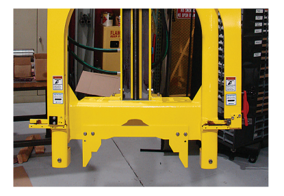
Guillotine saw shown with custom saddle for cutting steel I-beams, others available

WACHS UTILITY PRODUCTS 600 Knightsbridge Parkway Lincolnshire, IL 60069 +1 (847) 537-8800 www.turnvalves.com