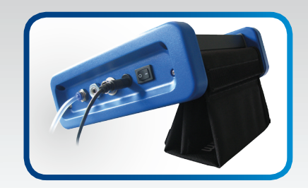
Protective cover doubles as a solid table stand for easier viewing of the display