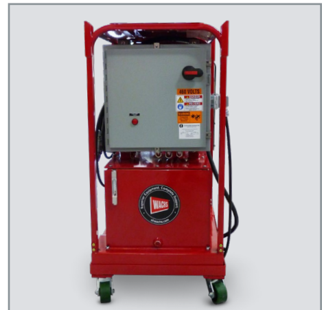
Large hydraulic oil reservoir with temperature and level gauge plus warning light.