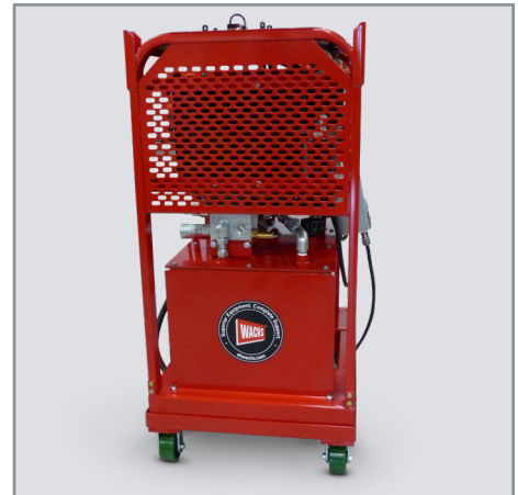
Innovative design submerges pump in oil reservoir for cooler, quieter operation.

The HPU-20's vertical design allows for a more compact footprint, making it easier to transport, store and operate in tight quarters. All the electronics are located above the oil reservoir for space savings, and away from any potential contamination. Placing the pump assembly inside the oil reservoir contributes to its compact design.