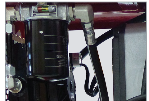
Spin on full flow hydraulic oil filter helps extend oil and pump life.