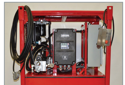
HPU-20GY model with water based glycol in place of hydraulic oil is also available.