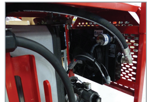
Heavy duty cooling and hydraulic manifold help keep fluid temperatures down.